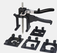
EASY PULLER - 1