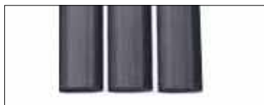
ART.WELD/01 (15 pieces) 11mm Flat Black PP*Strip