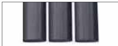
ART.WELD/02 (15 pieces) 19mm Flat Black PP*Strip