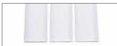
ART.WELD/04 (15 pieces) 19mm Flat White PP*Strip