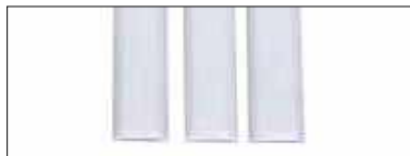
ART.WELD/03 (15 pieces) 11mm Flat White PP*Strip