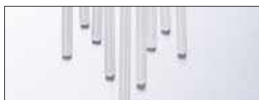
ART.WELD/05 (15 pieces) Strips Kit (7 Types)