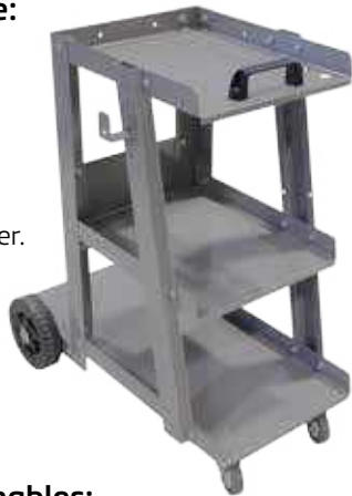
Trolley, including nitrogen tank holder.