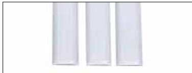
ART.WELD/03 (15 pieces) 11mm Flat White PP*Strip