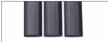
ART.WELD/01 (15 pieces) 11mm Flat Black PP*Strip