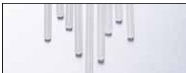
ART.WELD/05 (15 pieces) Strips Kit (7 Types)