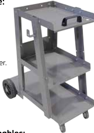
Trolley, including nitrogen tank holder.