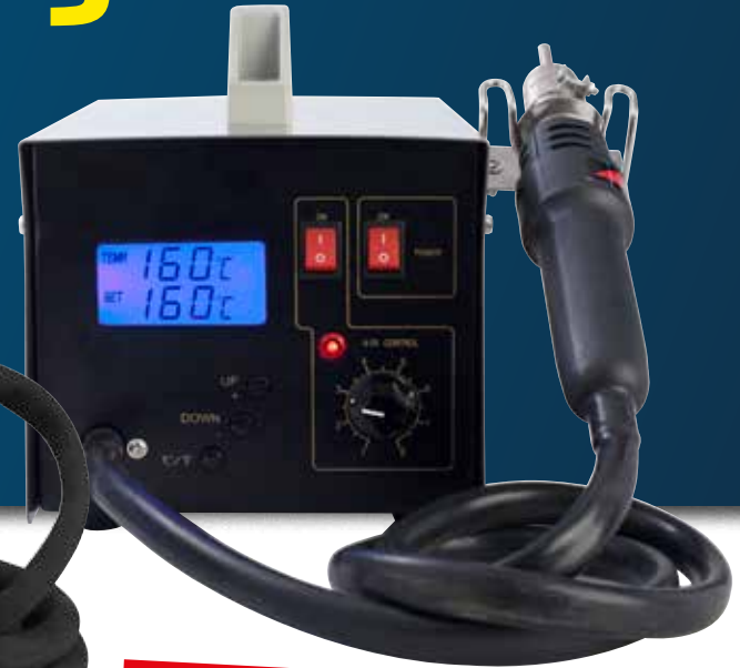
Hot Air Welder

The Hot Air plastic welder enables fast plastic repair, using a jet of hot air to fuse the plastics being welded together.