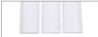
ART.WELD/04 (15 pieces) 19mm Flat White PP*Strip