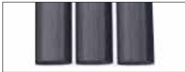
ART.WELD/02 (15 pieces) 19mm Flat Black PP*Strip