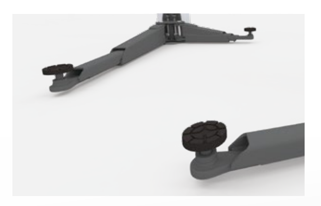
HEIGHT OF THE PADS Minimum height of the pads suitable for loading, of armoured cars as well.