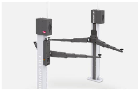
MORE SPACE FOR MOVEMENT AROUND THE VEHICLE The lift is designed to maximise its layout while ensuring minimum space requirements.