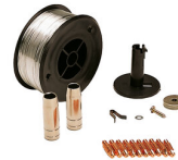
STAINLESS STEEL WELDING KIT D. 0,8 MM 802037