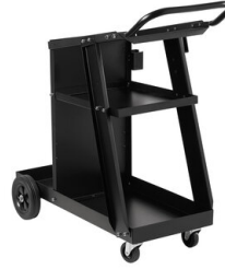
TROLLEY - AMERICA 803084