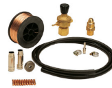
STEEL WELDING KIT FOR REFILLABLE BOTTLE 802148