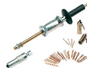
NAIL WELDING KIT 802034