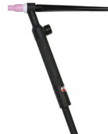
ST9V TIG TORCH AX25 4M 722563