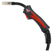
MT15 MIG TORCH 3M (RED) 742180