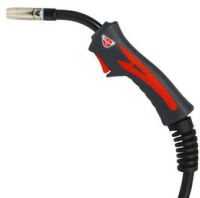
MT15 MIG TORCH 4M 742181