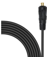
CABLE TW05V-A 1X025 1.80M PLUG ATLAS 124589