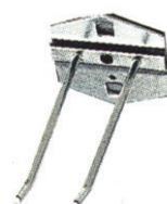
Art. 06500200 | Gancio doppio Double fixture